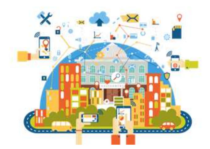
Figure 3: Government Services Systems

• Identity Theft: Attackers could exploit vulnerabilities to steal personal information, which can be used for fraudulent activities or impersonation, severely compromising citizen trust.